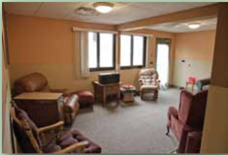
Before: Cramped living room, apartment 4