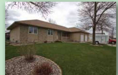
Recent home purchase in Eagle Lake