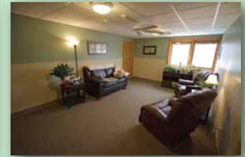
Expanded, attractive living room