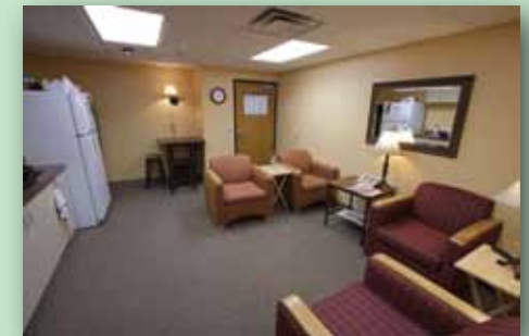
After: An attractive, relaxing setting