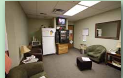
A not so great breakroom