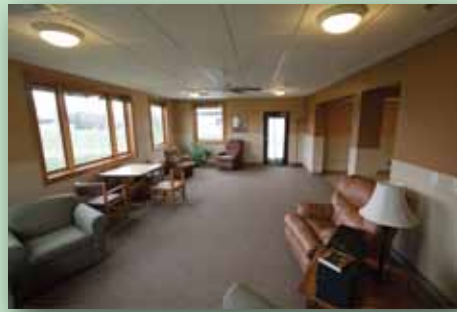
After: Bright and spacious addition