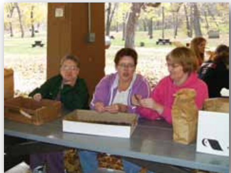
Volunteers sorting seeds at Minneopa State park

Look for a follow up summary of our strategic plan soon on our website.